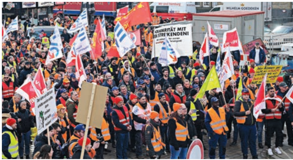
Hamburg, March 27: One-day strike by rail and service unions shows workers' willingness to fight. Trade-union misleaders are obstacle to workers struggle and must be replaced by revolutionary leadership.

On the economic front, the situation is gloomy. The European economy was already in a bad state before the pandemic, the rise of inflation and the war in Ukraine. Germany is far behind its competitors when it comes to digital technology. Its heavy industry sector, which has been at the heart of its success, is starting to lag as well. For example, German car manufacturers are scrambling to catch up with the Americans and Chinese in the production of electric vehicles. The latter have made good use of their economic ties with Germany to copy a number of its industrial techniques and technology. This increased competition is occurring in a context where Germany has committed more of its resources toward the military and where the best-case scenario is low growth. The Chinese market, which has been German industry's main prospect for growth, is becoming more competitive, more restrictive and is not growing as quickly as before. Looming over all of this is the decade-long policy of major central