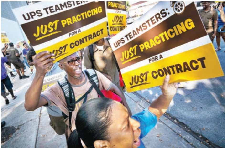
New York, July 6: Workers wanted to strike but O’Brien organized practice pickets for PR campaign, not militant class battle, before calling off potential strike.