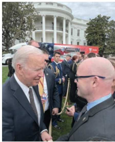
Teamsters April 2022: Teamsters head Sean O'Brien with Biden at White House. O'Brien later worked with government to quash potential rail strike, then squashed UPS Teamsters strike to avoid causing crisis for president.

Workers have everything to gain from rejecting these deals and fighting back right now. What better way to get the most concessions on and off the job than putting a weakened enemy on its knees? If you don't give us better wages, affordable health care and decent housing we'll make it hell for you! Every worker will benefit from this, especially black workers. Biden is desperate to get the votes of black workers in order to have a better chance of winning in 2024. But as black people know Biden has done absolutely nothing for them, which is why the Democrats are worried about losing their votes. Black people, allied with the whole working class, have the most to gain from