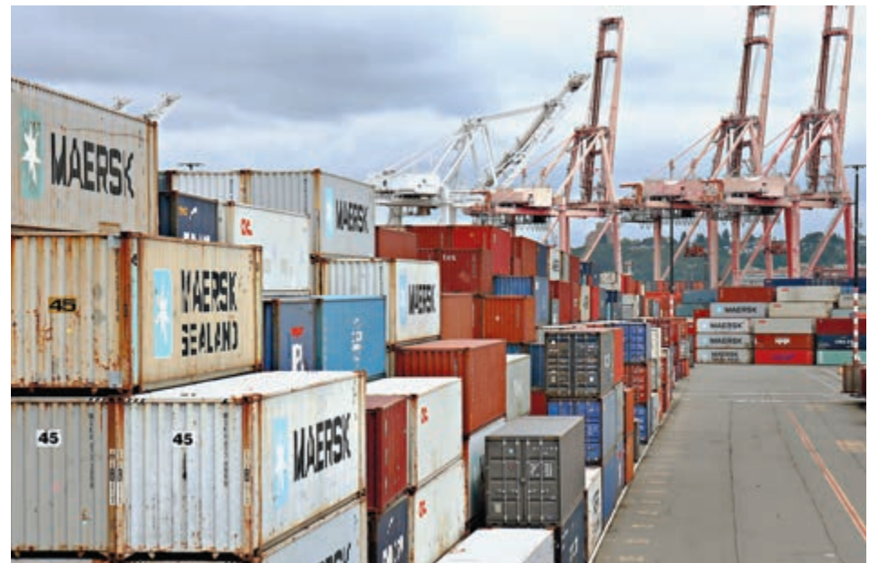
Port of Seattle, day after June 9-10 work stoppage. Longshore workers carried out job actions after working without a contract for over a year due to ILWU bureaucrats’ pledge to keep supply chain moving.