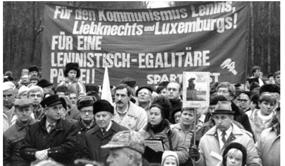
Berlin-Treptow Park, 30 December 1989: Protest against desecration of Soviet memorial. Spartacists exposed SPD as spearhead for counterrevolution, warned against betrayal by Stalinist rulers. Fight for revolutionary leadership is decisive!

The objective situation will push the working class toward revolution. However, this movement alone will not suffice. What history shows is that to fulfill its role as gravedigger of capitalism, the working class needs to liberate itself from the ideological hold of liberalism and break politically with social democracy. Just as it was necessary in 1914, the working class must throw out its pro-imperialist leadership and forge a new revolutionary party. The workers vanguard must be consciously led toward this struggle, organized around a revolutionary program. Breaking with its past practices, the SpAD's duty is to elaborate the key planks of this program. It must make use of the convulsions in society and in the left to organize a revolutionary pole in opposition to social democracy. The sooner such a pole can be established, and the deeper its political foundations, the bigger its impact will be on the outcome of the upcoming struggles in Germany and internationally. ■