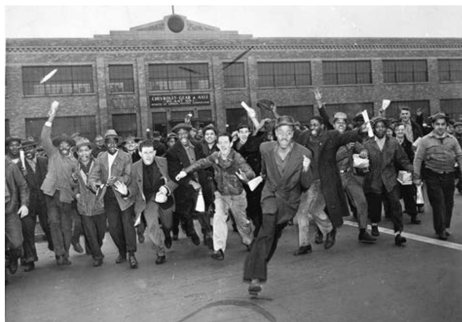
Striking auto workers pour out of GM plant in Detroit, 1945. Black workers have long been militant backbone of UAW.

The UAW bureaucracy's record of dismal failures in organizing the unorganized is a direct reflection of its losing class-collaborationist program, which has led to endless givebacks in recent years. Who wants to join a union that goes backward? On the other hand, a powerful and victorious strike now would lead hun-