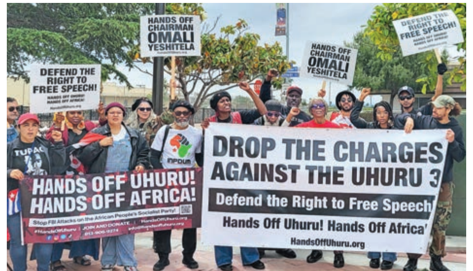
The Burning Spear San Diego, May 27: March protesting racist witchhunt against Uhuru/APSP. Three members and supporters face prison on trumped-up charges of conspiring to act as "agents" for Russia.

Those are the interests of a dominant imperialist power in decline, conscious that it is sitting upon a volcano of discon-