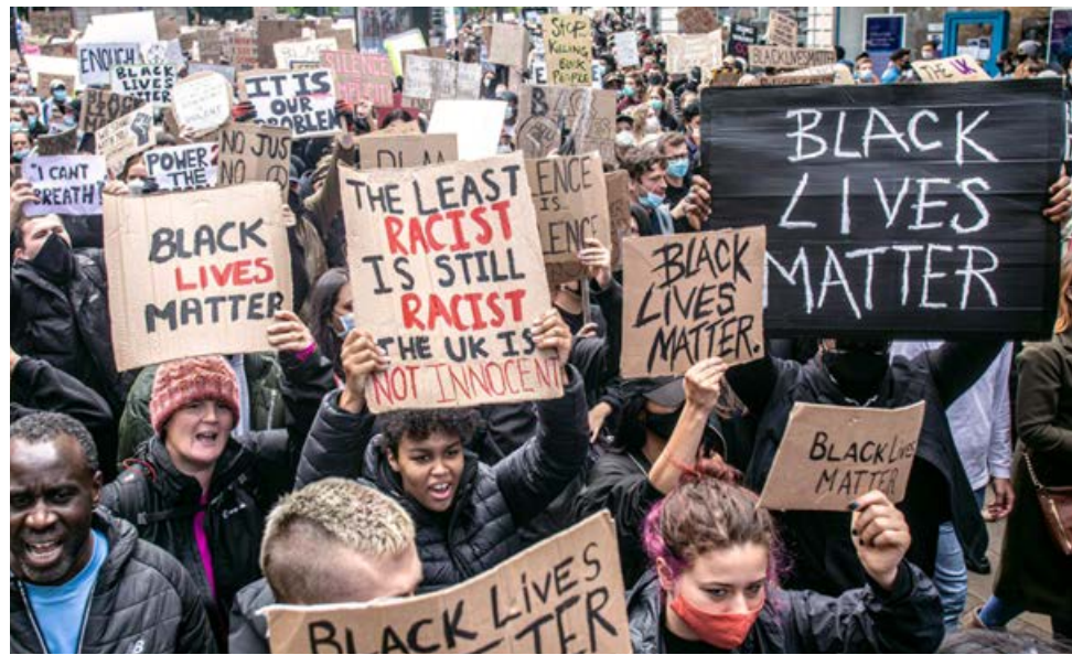
Black Lives Matter protest in Manchester, 6 June 2020.

“That BLM has not led to any significant progress for black people is pretty obvious and uncontroversial. The real question is: why? ”