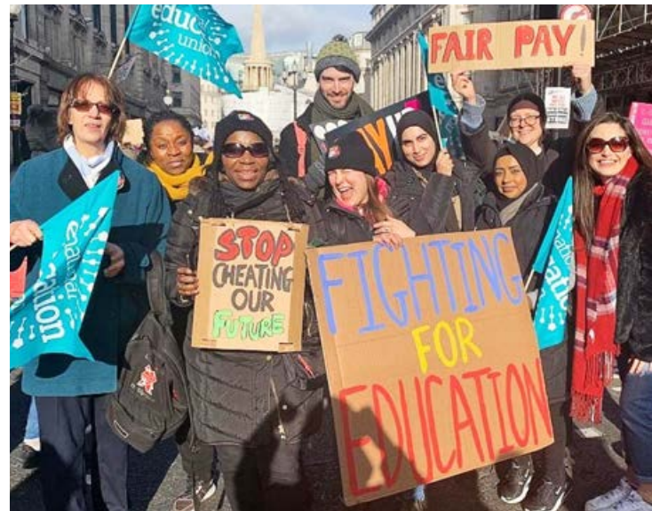
NEU teachers have struck for decent pay and funding, but union leadership sabotages this struggle at every turn.

The British labour movement crawls with people claiming to be against capitalism and for socialism. Groups like the Communist Party of Britain/Young Communist League,