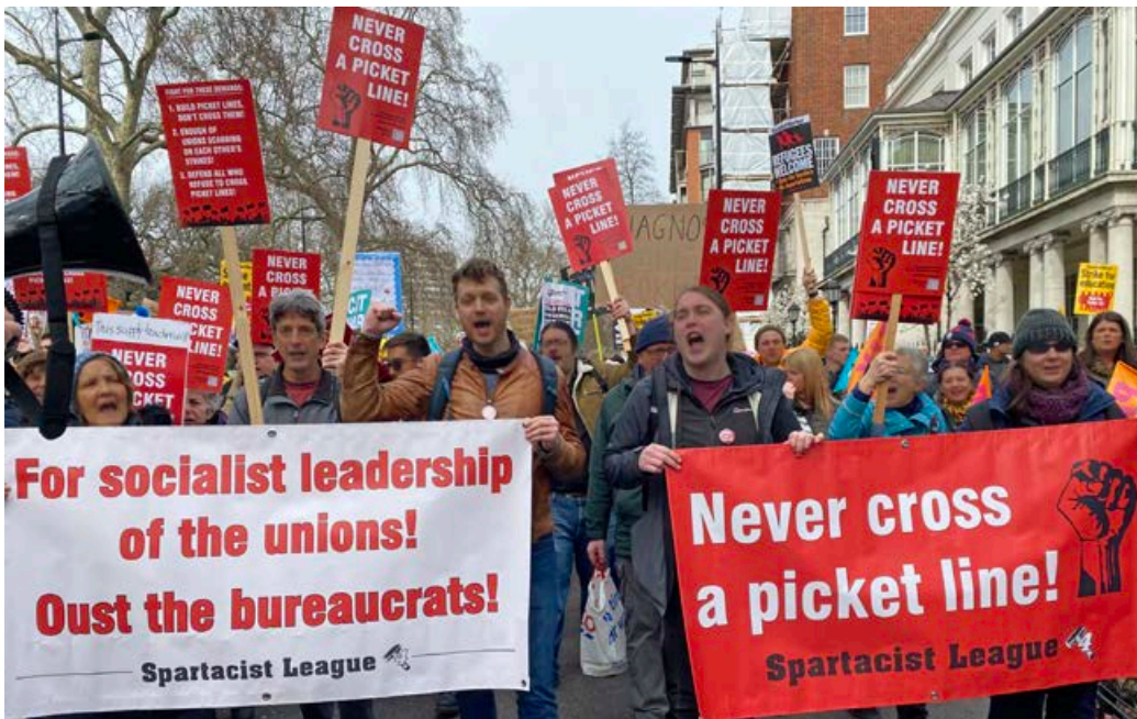
London, 15 March: Spartacist contingent at demonstration of striking public sector unions.

Why are we campaigning around these demands? Before answering this question, I would first like to answer: what is a picket line? The purpose of a picket line is to shut down a workplace on strike. In the struggle against the bosses over wages, working conditions and jobs, stopping the flow of profit and the functioning of a workplace is the only weapon the working class has. The picket line’s purpose is to implement this by keeping the workplace shut. Anyone who crosses it or finds a way around it, and anyone who crosses any picket (not just of their own union but of any union)