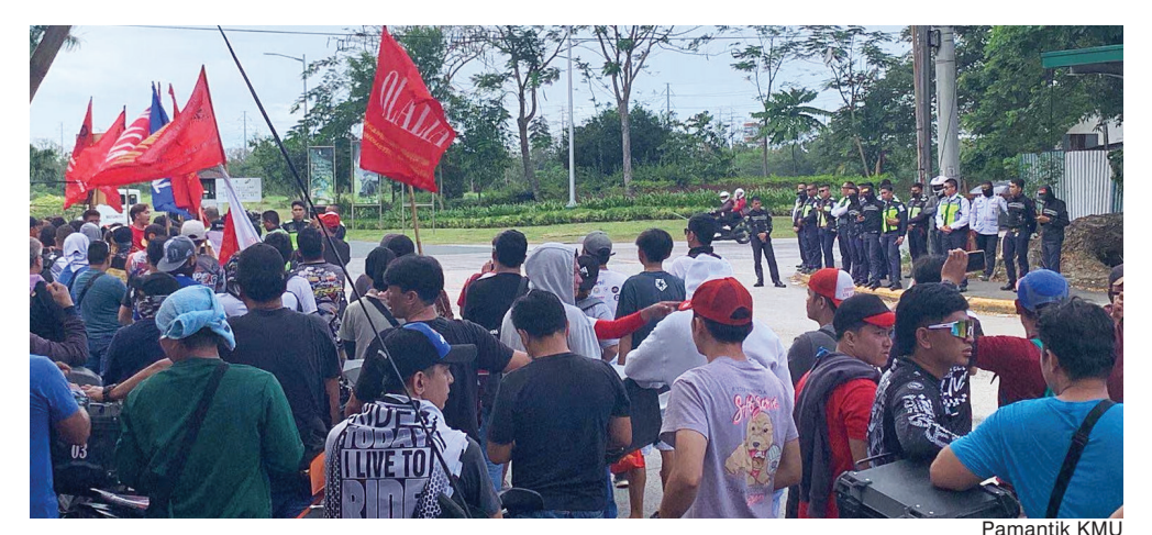
KMU-affiliated workers at Dutch Nexperia electronics plant confront private guards attempting to break their picket line. The unions must stand together against the imperialist bosses!

imperialists. At the same time, the proletariat grew as new layers were drawn into manufacturing. A large urban petty bourgeoisie emerged which, like the proletariat, is exploited by imperialist finance capital. The Filipino working people directly confront the imperialist bosses.