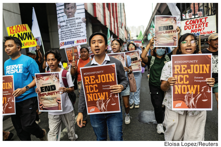
National Democrats demand that the Philippines rejoin the imperialist-controlled International Criminal Court. This only discredits the left in the eyes of the masses.

but the real drain on the country's wealth is not the trapos lining their pockets. It's the imperialists draining the country. The political dynasties have grown rich by helping the imperialists plunder the nation. Obviously, they can't be trusted to combat this plague. They must be forced to open the nation's books to the people, so everyone knows how much of the nation's wealth is going into dodgy deals to attract imperialist investors, what land and resources are being used to enrich foreign finance capital at the expense of the development of the nation, who is taking bribes from the imperialists. If the political dynasties refuse, their assets should be seized and used to benefit the people!